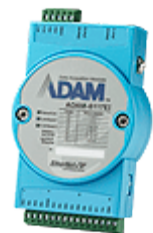
Figure 4 - More robust than standard Ethernet

Although EtherNet IP was developed by Rockwell Automation for its Allen-Bradley line of controls, it is now considered an open standard, and is managed by ODVA ( www.odva.org ). Formerly known as the Open DeviceNet Vendors Association, ODVA now calls itself "the organization that supports network technologies built on the Common Industrial Protocol (CIP) — DeviceNet, EtherNet/IP, CompoNet, and ControlNet." EtherNet IP is designed for those control applications that can accommodate a measure of non-deterministic data transfer, but it is significantly more robust and deterministic than standard Ethernet and TCP/IP are.