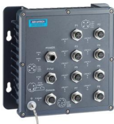
Figure 2 - Smart switch manages Ethernet traffic

Ethernet networks consist of nodes, switches, routers and repeaters. Switches, especially smart managed switches, have made it possible to have Ethernet networks consisting of a nearly infinite number of nodes.