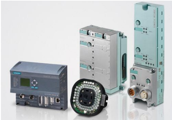
Figure 5 - Real Time Ethernet

ODVA has revised the CIP protocols to work together. There are millions of Profibus nodes installed in both discrete and process automation.