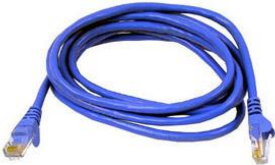
Figure 1 – Ethernet is ubiquitous in the enterprise

Twenty years ago, there were competing network protocols in the enterprise (office) network space. Today, no one would believe that, because there is only one network protocol that is used in 99%-plus of all enterprise networks. That network is Ethernet running TCP/IP.